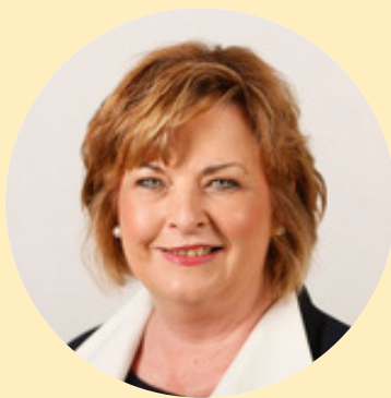
Fiona Hyslop Culture Secretary