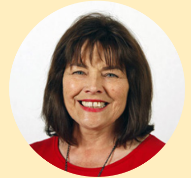
Jeane Freeman (then Minister for Social Security, now Health Secretary) on My Great Start

It is vital that those on low incomes can access timely and high quality support and advice, which is why services like My Great Start are to be welcomed. We want to make sure as many people as possible have a warm, safe home and I'm pleased that organisations such as the Wheatley Group are helping people to manage their finances.”